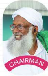
MT ABDULLA MUSLIYAR