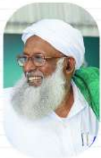
MT ABDULLA MUSLIYAR