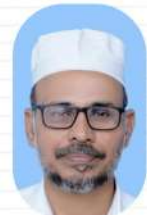
MP ABDURAHMAN MASTER